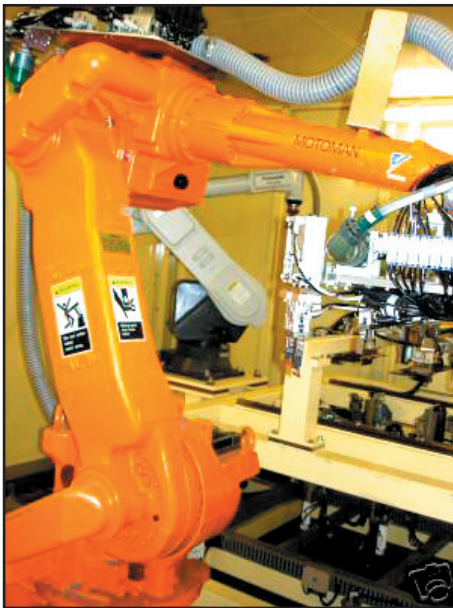
"2003" Motoman Model UP-50 6 Axis Machine Tending or Handling Robot