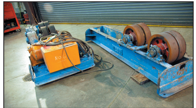
WEBB T-18/I-18 12,000 lb. Turning Rolls