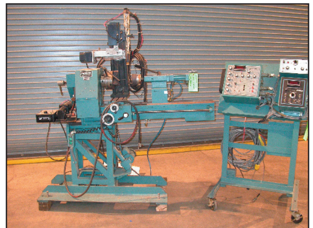
Jetline Lathe Model CWP-24 90° Power Tilting Weld Lathe Bed