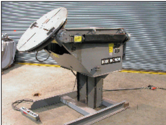
Koike Aronson GE-25A 2,500 lb. "Geared Elevation Positioner"